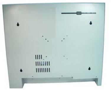
DM-170Chassis Rear view (with OSD buttons)