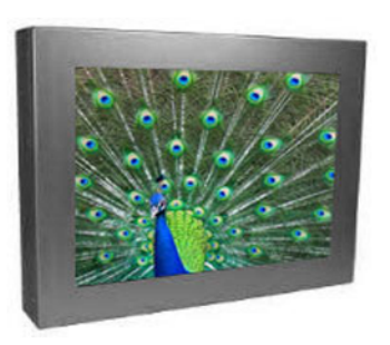
DM-170Chassis Front view